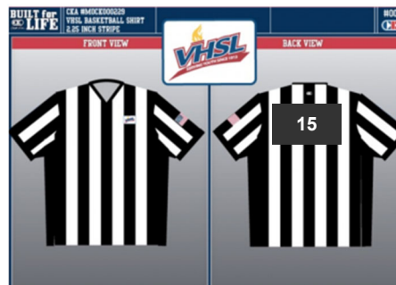
FIGURE 1. FLAG & VHSL EMBLEM LOCATION 2 1/4 " STRIPED SHIRT

b) Black football official pants with a 1-1/4" white high-visibility stripe down the outside of each leg shall be worn by the entire crew during SEFOA assigned games.